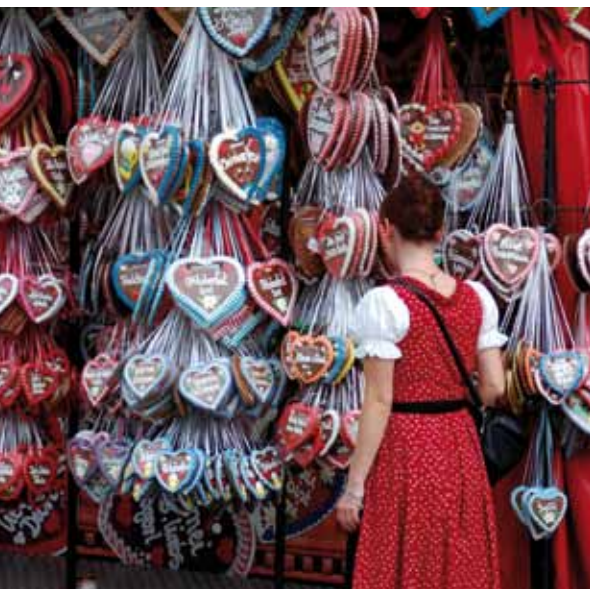
Bavariastatue, Oktoberfest, Herzerl Stand (Gingerbread Heart), big wheel

The project team will try and take over directly as many expenses as possible or otherwise arrange for the costs to be processed and refunded as soon as possible.